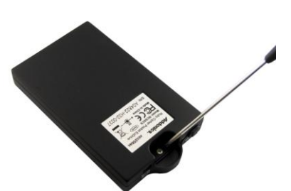
Step 1 Separate the top from the bottom cover of the drive enclosure by loosening the screw as shown on the photo.

Step 2 Align the SATA connector in the 2.5" hard drive with the SATA connector on the PCB.